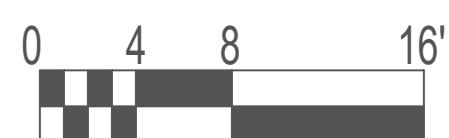
1 ROOF AND SITE PLAN Scale: 1/8" = 1'-0"