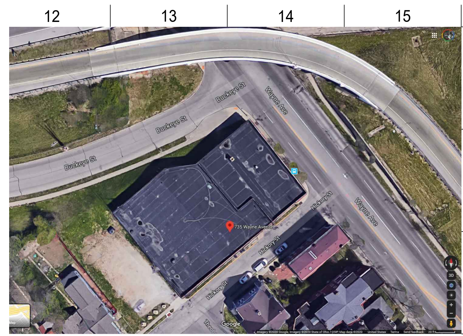
2 AERIAL VIEW Scale: NTS