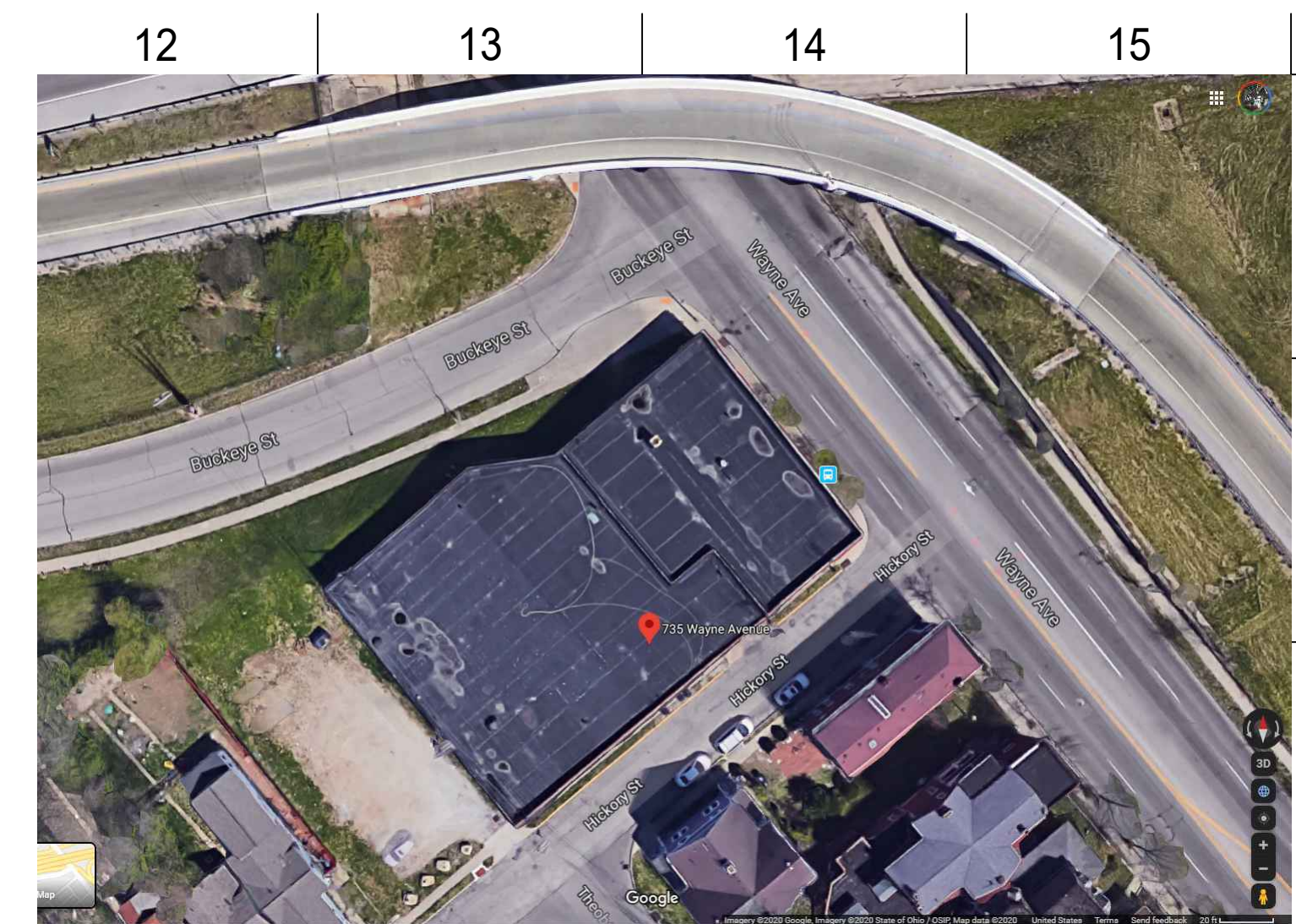
2 AERIAL VIEW Scale: NTS